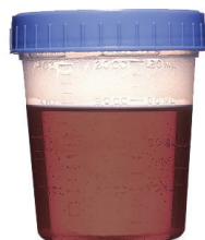
DARK ORANGE AND SEMI-CLEAR NOT OK