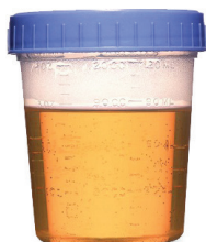
LIGHT ORANGE AND MOSTLY CLEAR ALMOST THERE!