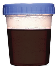
DARK AND MURKY NOT OK

If your bowel movements are already running clear yellow, you do not need to take the second bottle of magnesium citrate.