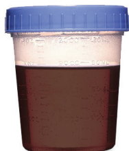
BROWN AND MURKY NOT OK