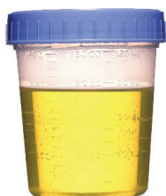
YELLOW AND CLEAR, LIKE URINE YOU'RE READY!