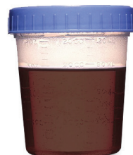
BROWN AND MURKY NOT OK