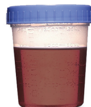
DARK ORANGE AND SEMI-CLEAR NOT OK