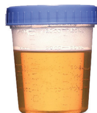
LIGHT ORANGE AND MOSTLY CLEAR ALMOST THERE!