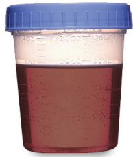
DARK ORANGE AND SEMI-CLEAR NOT OK