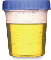
YELLOW AND CLEAR, LIKE URINE YOU'RE READY!