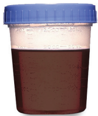
BROWN AND MURKY NOT OK