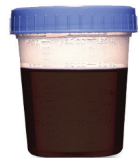
DARK AND MURKY NOT OK

HERE ARE SOME TIPS! Rapid drinking of each portion is better than drinking small amounts continuously. As you drink the mixture you may feel nauseous, or like you need to use the bathroom. It's a good idea to stay close to your bathroom while you drink the mixture. If you do start to feel nauseous, stop drinking the prep solution for a while until the feeling passes, then resume. About 1 to 2 hours after you've started drinking the prep solution, you should have started having bowel movements.