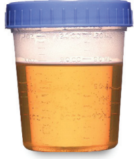
LIGHT ORANGE AND MOSTLY CLEAR ALMOST THERE!